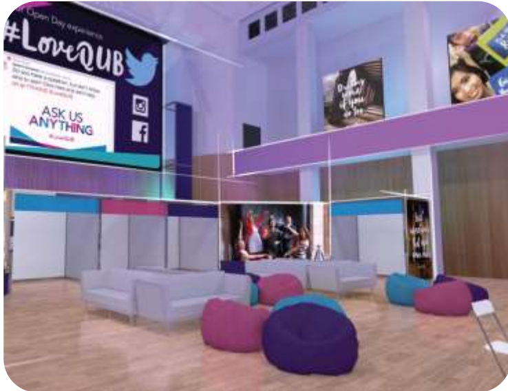
Arts, Humanities and Social Sciences Student Conversation Zone