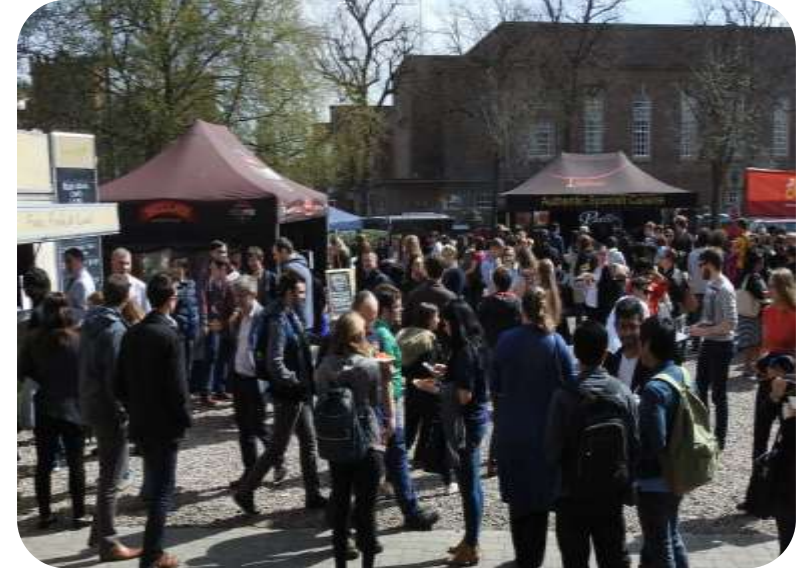
The Food Market